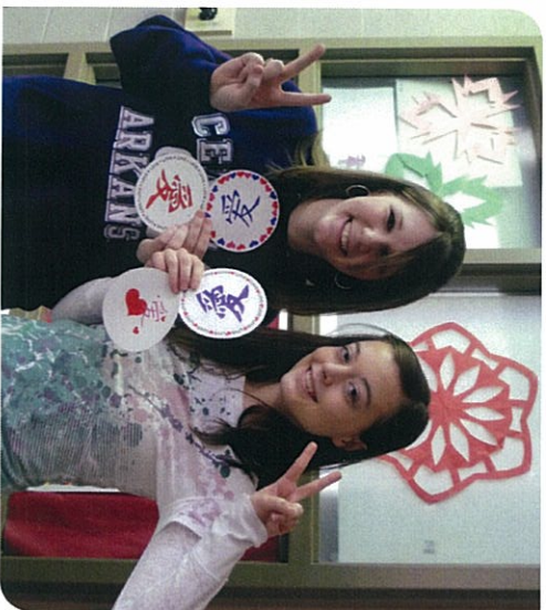
CONWAY HIGH STUDENTS WITH CUT PAPER CHARACTERS