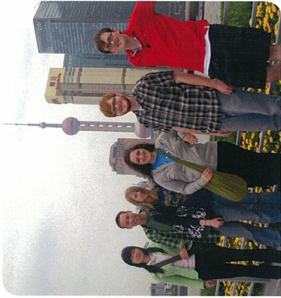
PROGRAM STUDENTS IN SHANGHAI