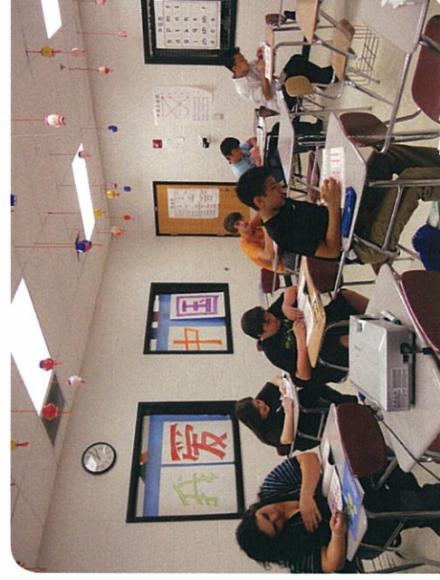
WALDRON HIGH SCHOOL CHINESE CLASSROOM

The Program enters its 3 rd year in 2010. It is a partnership between Hanban, the Arkansas