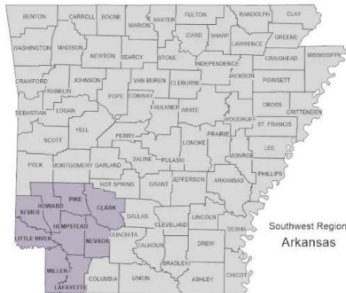
Southwest Trainees 53 Total Trainees in 2024-2025