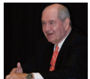
Governor Sonny Perdue of Georgia, the 2006-2008 SREB Chair, led the SREB Committee to Improve High School Graduation Rates and Achievement.

SREB will assist states by reporting state progress in implementing these essential policies.