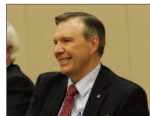
SREB will report to state leaders on measurable results.

If the links prove strong — helping SREB states learn which policies lead most directly to results — states may be able to move more quickly to greater gains. Indeed, SREB states may well be positioned to lead the nation on significantly more indicators of educational excellence.